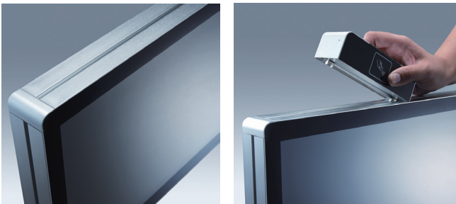
Side groove design for Flexible peripheral device